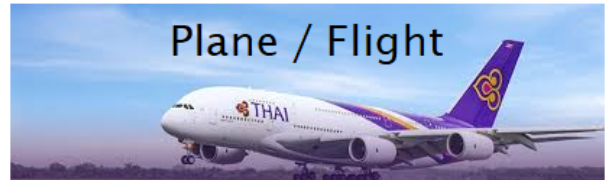
Plane / Flight