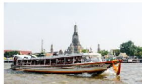
Ferry / boat